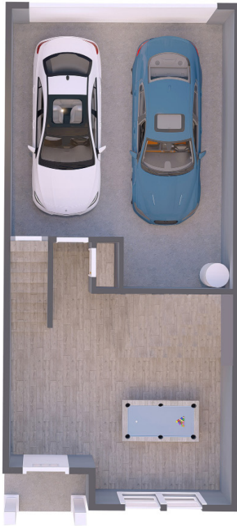
First Floor (Standard)