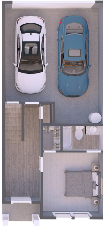
First Floor (Option 1- Master Suite)