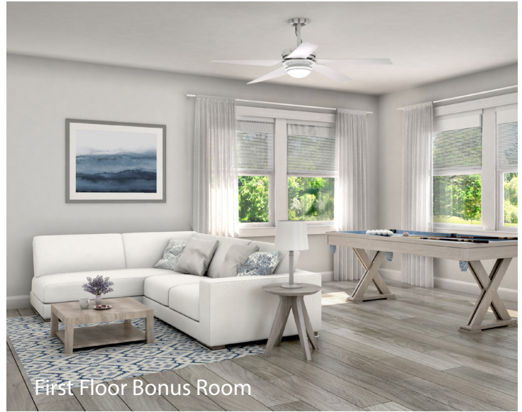
First Floor Bonus Room